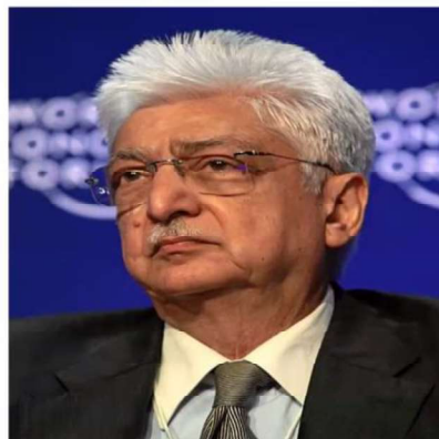
AZIM PREMJI Chairman of Wipro